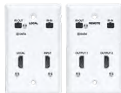
HDMI to 2 x HDMI B127A-2A1-FHFH Dual-Output Extender/Splitter Kit