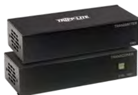
DisplayPort to HDMI