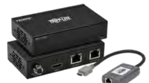
HDMI to 2 x HDMI B127A-002-BHPH2 2-Port Extender/Splitter Kit*