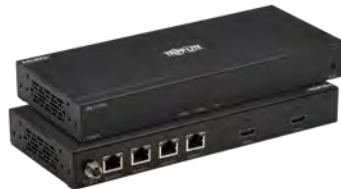
HDMI B127A-004-BH 4-Port Extender/Splitter*