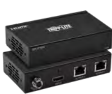
HDMI B127A-002-BH 2-Port Extender/Splitter*