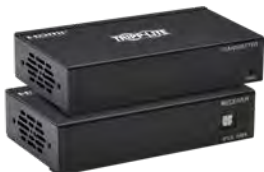
HDMI to 2 x HDMI B127A-2A1-BHBH Dual-Output Extender/Splitter Kit