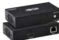
HDMI B127A-1A0-BH Add-on Receiver*