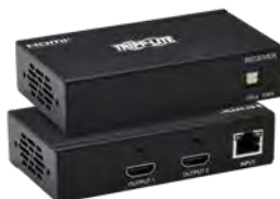
2 x HDMI B127A-2A0-BH Add-on Receiver (Dual Output)