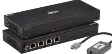
HDMI to 3 or 4 x HDMI B127A-004-BHPH3 4-Port Extender/Splitter Kit*