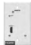
HDMI B127A-1A0-FH Add-on Receiver