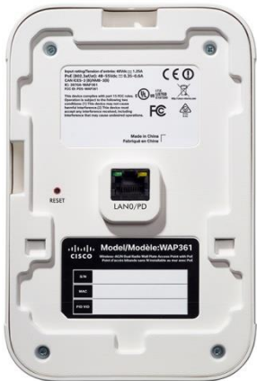
Figure 4. Side Panel of the WAP361 Wireless-AC/N Dual Radio Wall Plate Access Point